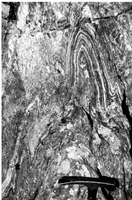
Figure 1: Asymmetric, S- and Z-shaped, parasitic folds in folded, foliated metagabbros, Val Malenco, Southern Swiss Alps.

We use the finite element method to simulate slow viscous (Newtonian) flow in two dimensions without gravity and to model asymmetric (S- and Z-shaped) and symmetric (M-shaped) parasitic folds during multilayer folding. During multilayer folding, the matrix between stiffer layers shows a deformation close to pure shear in the hinge area and a combination of pure and simple shear in the limb areas. Thinner layers placed between thicker layers develop symmetric parasitic folds in the hinge, and eventually asymmetric parasitic folds in the limbs of the larger fold. Our results verify numerically the theory that asymmetric parasitic folds develop from symmetric buckle-folds that are sheared by the hingeward relative displacement of the thick layers in the limbs of the first-order fold. To develop asymmetric shapes, the amplitudes of the parasitic folds must exceed a critical value before the first-order fold begins to amplify. Otherwise the parasitic folds are unfolded during flattening that takes place in the limb area between the thick layers. More than five thin layers are necessary to generate distinct asymmetric parasitic folds for the applied model setting. More layers generate higher amplification rates in the thin layers and, hence, higher amplitudes.